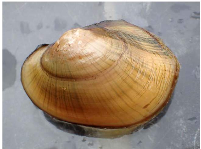
Tidewater Mucket ( Leptodea ochracea ) from Mystic Lake.

In the summer of 2009, there was an exceptionally large mussel die-off that began in early August and quickly escalated, reaching a peak by mid-month. In 2010, Biodrawversity was contracted by the Natural Heritage and Endangered Species Program (NHESP) to repeat the 2007 mussel survey, determine the magnitude of the mussel die-off, and provide a status report for state-listed mussel populations in Mystic