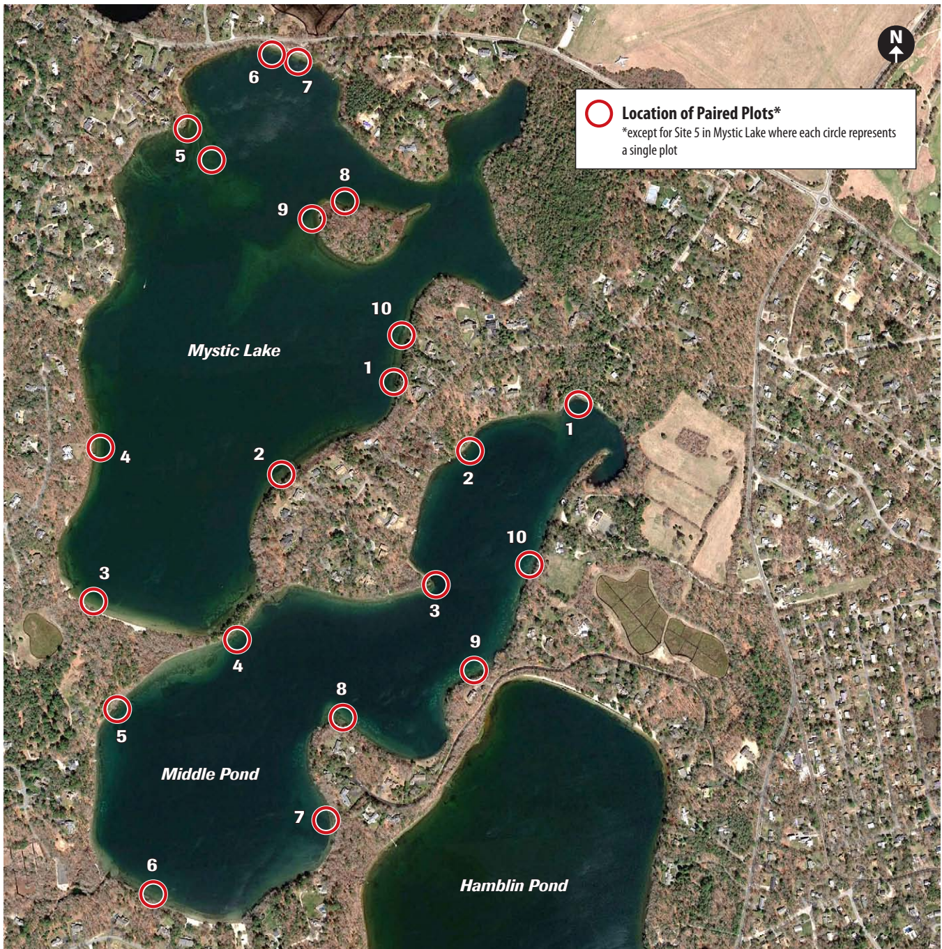
Figure 1. Mussel sampling sites in Middle Pond and Mystic Lake, 2007 to 2017. Not all sites were surveyed each year; see Table 1 for details on locations and year(s) sampled.

Lake (Biodrawversity 2010b). The 2010 survey (conducted in June) also established a new baseline prior to a lake-wide alum treatment that occurred in September 2010. A second mussel die-off occurred in August-September of 2010, after the baseline study was completed but before the alum treatment began. Prior to, during, and after the alum treatment, Biodrawversity biologists monitored mortality and behavior of freshwater mussels that had been placed