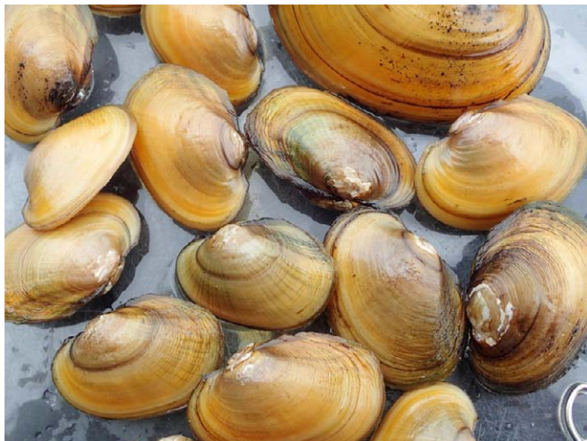
Juvenile tidewater mucket from Mystic Lake.

Mystic Lake: In 2007, a total of 529 live tidewater mucket, 10 triangle floater, and 9 eastern pondmussel were counted within 17 plots (each plot was 5x5 meters, or 25m 2 ). Although common mussel species were not counted in 2007, observations suggest that eastern elliptio and eastern lampmussel were the two most abundant species. In 2010, the first lake-wide survey after the 2009 die-off, only 31 live tidewater mucket and 9 live triangle floater were counted within 16 plots. Shell (dead animal) counts within plots totaled 491 tidewater mucket, 11 triangle floater, and 10 eastern pondmussel. Eastern elliptio were still common in some areas of the lake. In 2011, counts were extremely low for all mussel species. Only one tidewater mucket was found in 18 plots; no live triangle floater or eastern pondmussel were observed. Eastern elliptio was the most common mussel species (84 observed), and only four live eastern lampmussel were found.