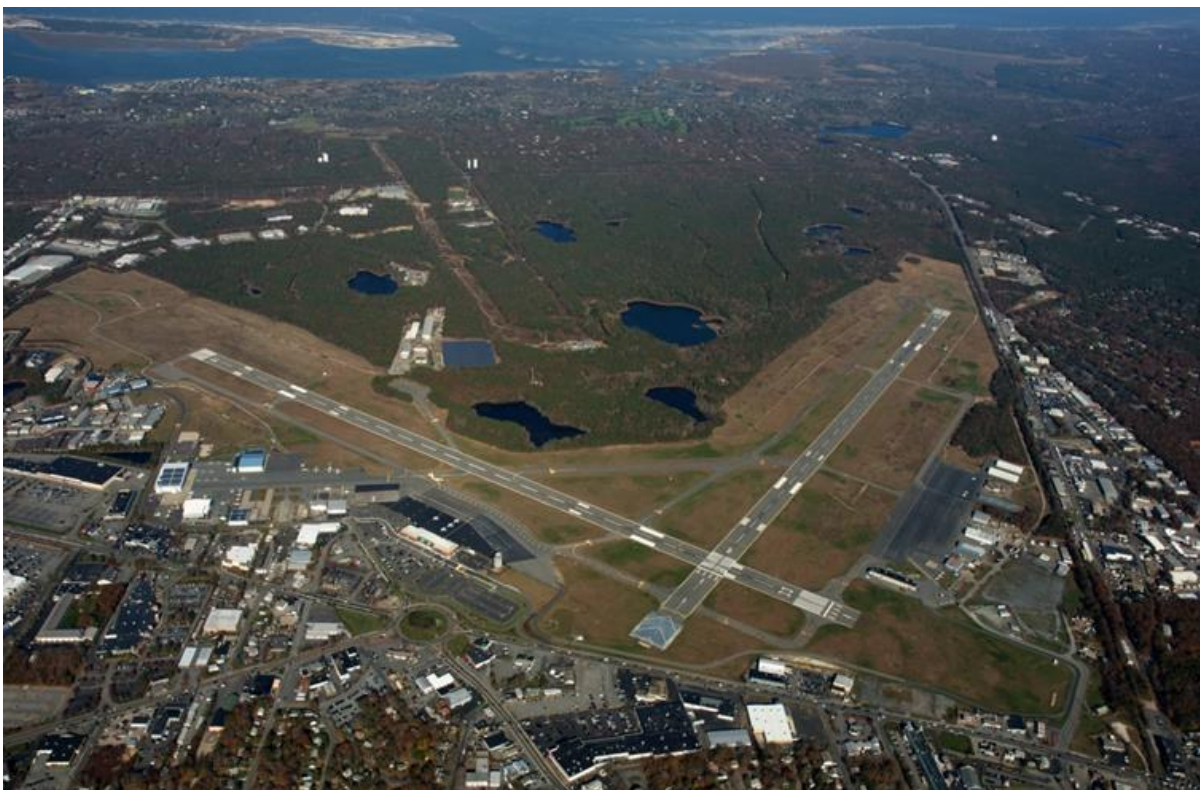
Aerial view: Barnstable Municipal Airport looking North / Northeast. Sandy Neck Point and Barnstable Harbor are in the top left corner of photograph.

c. Provide funds to contract for part-time consulting services for up to 12 weeks to train new Assistant Airport Manager in the amount of $11,975; plus reimbursement for expenses not to exceed $2,000. Discussions with the Human Resources Department indicated that in order for the Airport to properly train the replacement for the Assistant Airport Manager, we could not hire a new replacement and carry over the incumbent; and that we would have to retire the incumbent, hire the replacement; and then bring back the now retired former Assistant Airport Manager as a consultant for a brief period of time. The expertise of the current incumbent will be almost impossible to replace due to his 20 years of experience with all aspects of the airport and his knowledge of all systems, equipment, FAA Part 139 Regulations, operations, procedures, and so forth. Management feels it absolutely necessary to have an extensive overlap of the two individuals to assure that the knowledge of the airport is passed along to the new Assistant Airport Manager.