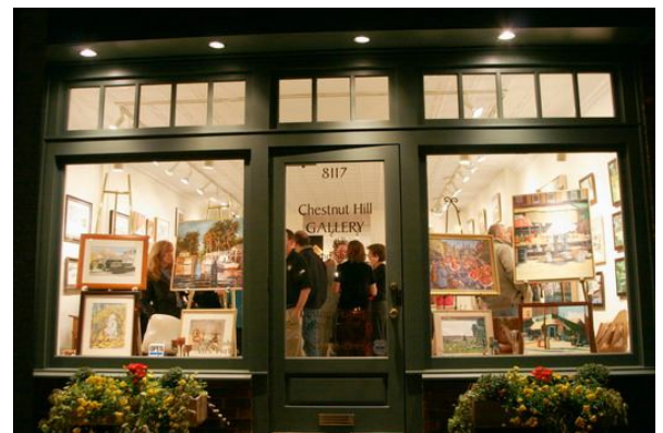
A well-lit exterior and interior storefront