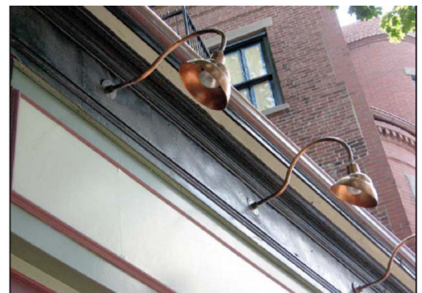
Gooseneck light fixtures are recommended to illuminate signage