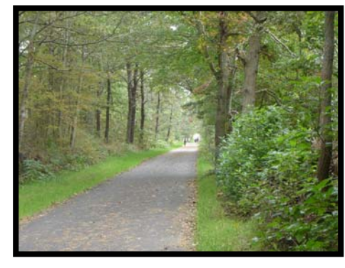
Proposed Regional Bikeway