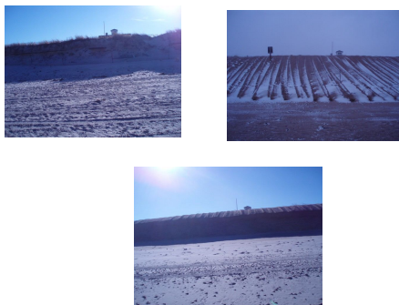
Before and After Dune Restoration Sandy Neck Beach Park December 2013 Bathhouse and Bathhouse Looking East