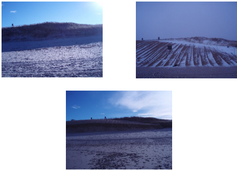
Before and After Dune Restoration Sandy Neck Beach Park December 2013 Upper Lot and Upper Lot Looking East