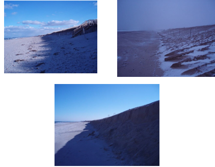
Before and After Dune Restoration Sandy Neck Beach Park December 2013 Bathhouse and Bathhouse Looking East