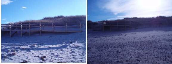
Before and After Dune Restoration Sandy Neck Beach Park December 2013 Handicapped Ramp Looking East