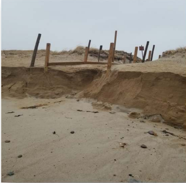
Public Beach: lower parking lot pedestrian access point.