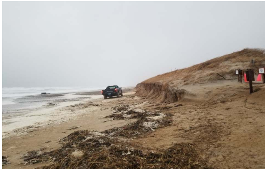
Public Beach: looking east from "old" handicapped ramp