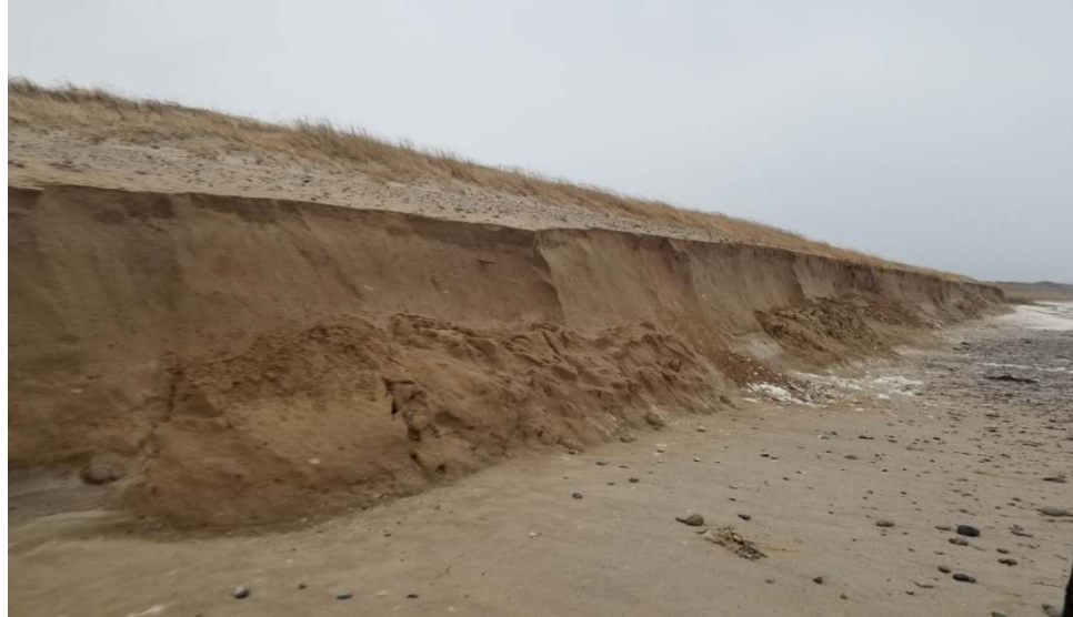
Public Beach: dune in front of upper parking lot.