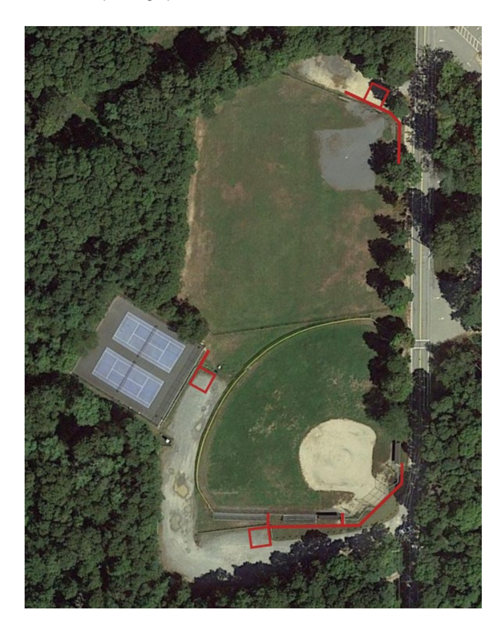
Image 2: Red lines show the approximate location of a path providing suggested accessible routes to the boundary of sport activity, player and spectator seating, practice areas, and accessible parking spaces.